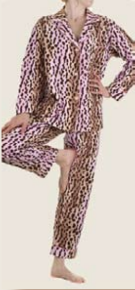
1002-F-738 Pink Cheetah Classic Flannel Pajama Set

As seen in many popular magazines and movies