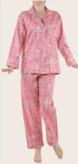
1002-L-566 Classic Luxe Hot Pink Fleur de Lis