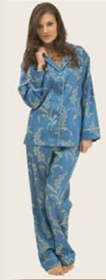
1002-L-754 Classic Luxe Blue Pom-Pom