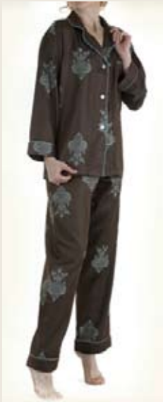
1002-L-560 Chocolate Chandelier Luxe Classic Pajama Set