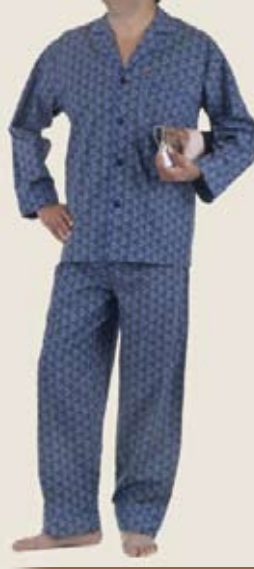
1002-M-889 Blue Casablanca Men's Classic Pajama